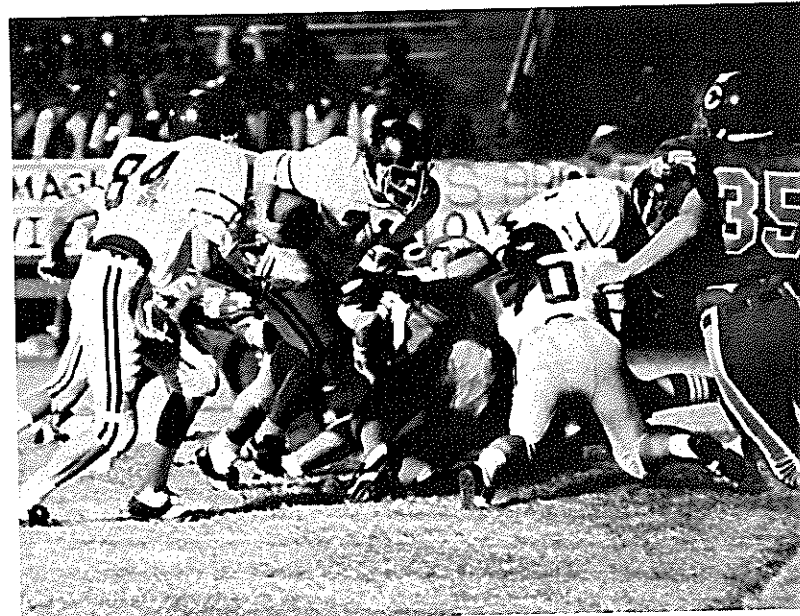
During the Jacket/Crane clash, the Jackets display a fine offensive strategy.

Crane has been totally dominated by the Yellow Jackets through the years, with the last Crane win coming in 1955.